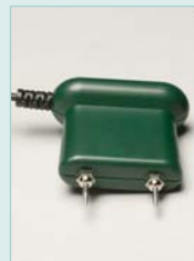
MO290-P Moisture Pin Probe