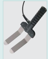
MO290-BP Moisture Baseboard Probe