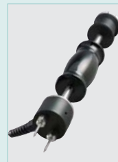
MO290-HP Moisture Hammer Probe