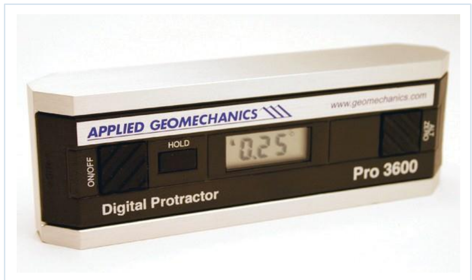
Pro 3600 Digital Protractor

at the top and bottom surfaces of the instrument. The top and bottom surfaces are parallel to within ±0.005 inch (±0.1mm). A V-groove runs the length of the bottom surface for easy placement on curved surfaces such as pipes or tubes. There are two threaded mounting holes in the bottom of the Pro 3600 for fastening to a mounting surface with screws.