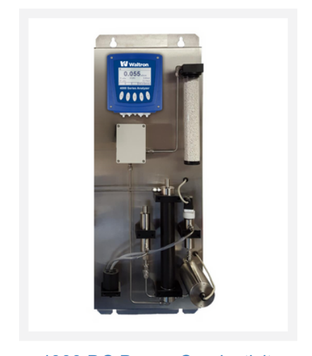
4000 DC Degas Conductivity