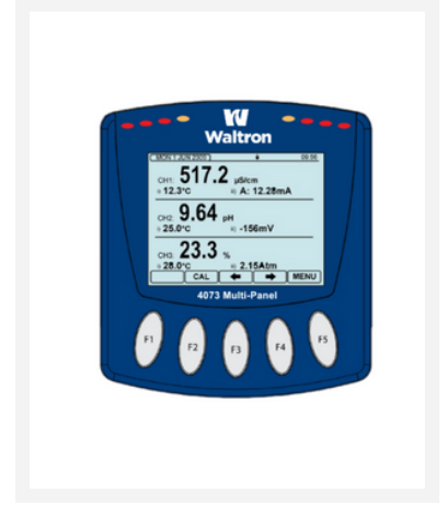
4073 Multi-Sensor Transmitter