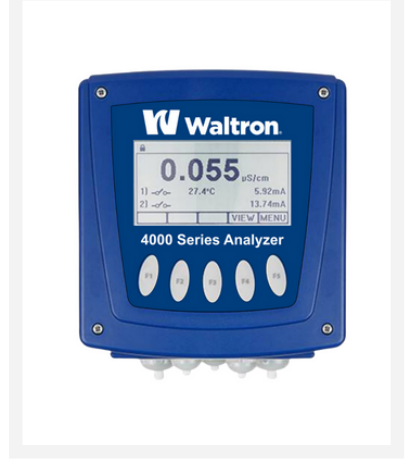
4000 Series Transmitter