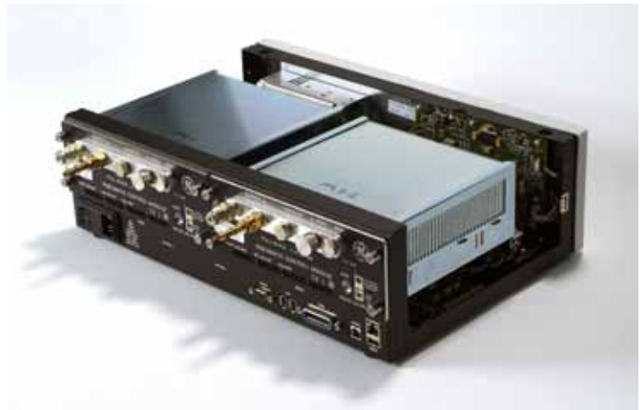
Pneumatic Control Module