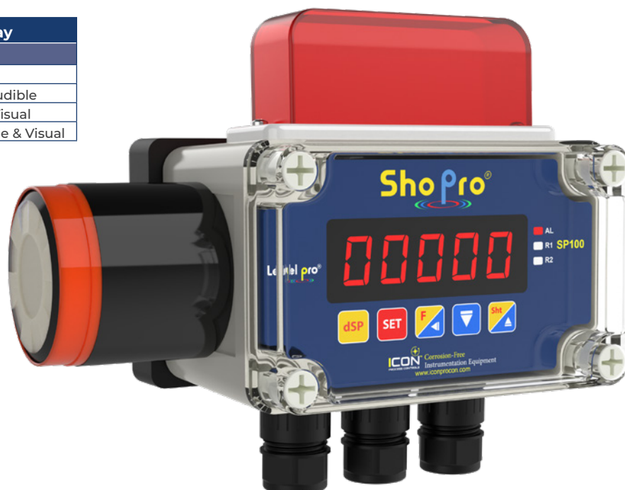
Shown with optional audible and visual alarms.